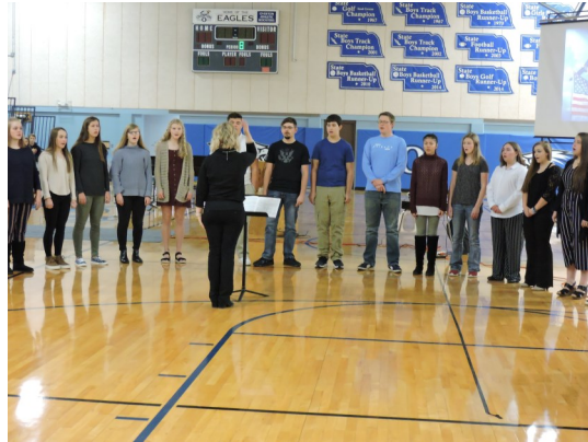
Overton High School Choir