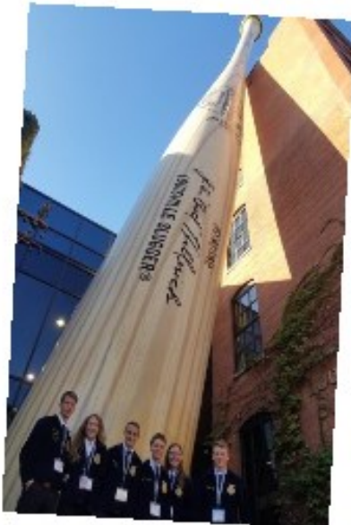
National Convention attendees at the Louisville Slugger Tour & Lucas Oil Stadium for the session